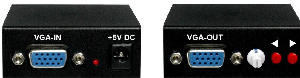
Model #: C-VGA-DSKW