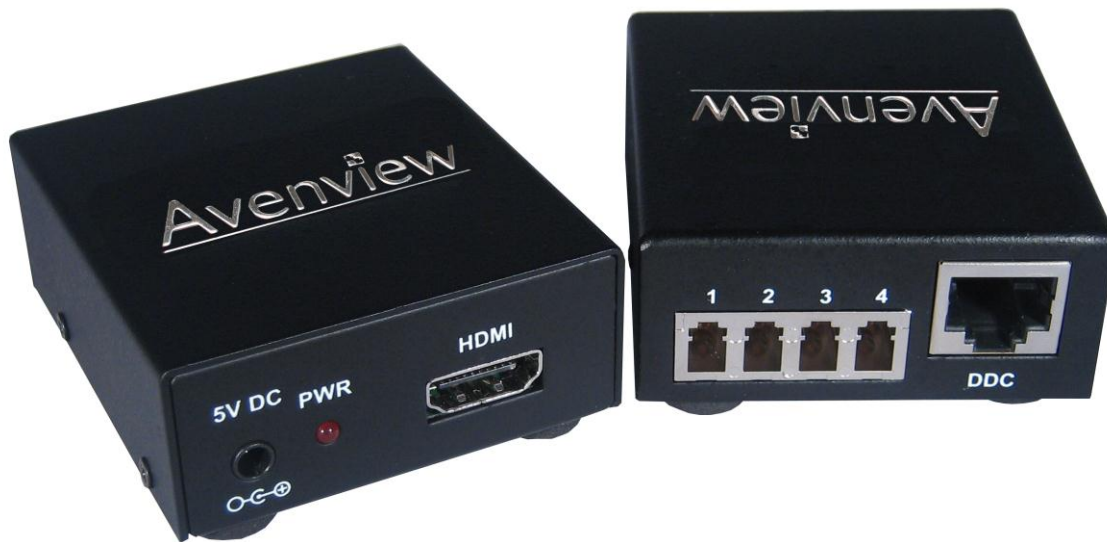
Model #: FO-HDMI-SET