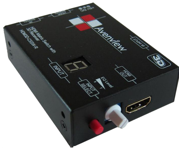
Model #: HDM3D-C5SW-R

HD ready 1080p HDMI HDCP 7.1CH Audio TRUEHD