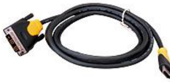
DVI to HDMI Cable (For Player)