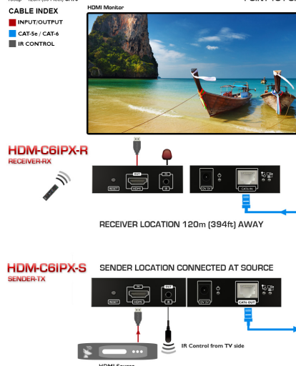
Application Diagram 1 POINT TO POINT

1080p = 90m (295 feet) CAT5e 1080p = 120m (394 feet) CAT6 CABLE INDEX ■ INPUT/OUTPUT ■ CAT-5e / CAT-6 ■ IR CONTROL